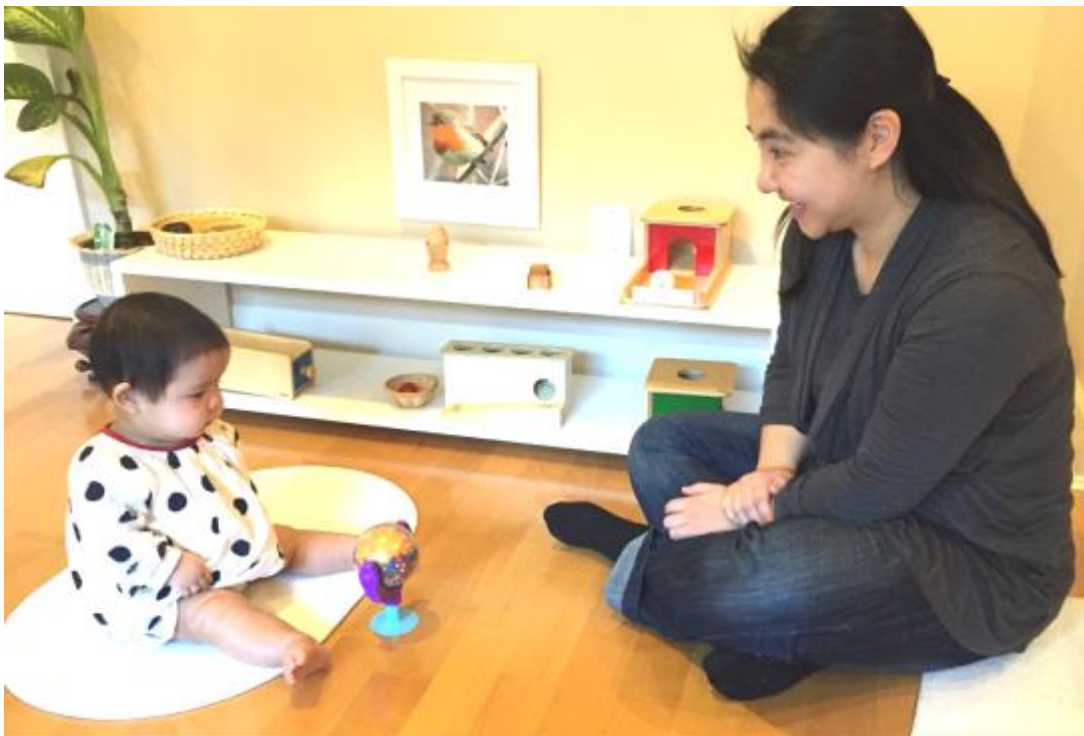
Mother and child attend a Parent-Infant Class

For children under the age of three, there are several Montessori environments. Created especially for working parents, a Nido is an environment prepared for children from 2 or 3 months until they are walking well. The Parent-Infant class provides a setting in which parents and their children, aged two to twelve months, are gathered under the care of a trained adult. After they begin to walk, the children join the Infant Community where their primary motor coordination, independence and language are cultivated. Rather than a classroom, it is a nurturing environment where very young children experience their first structured contact with other children.