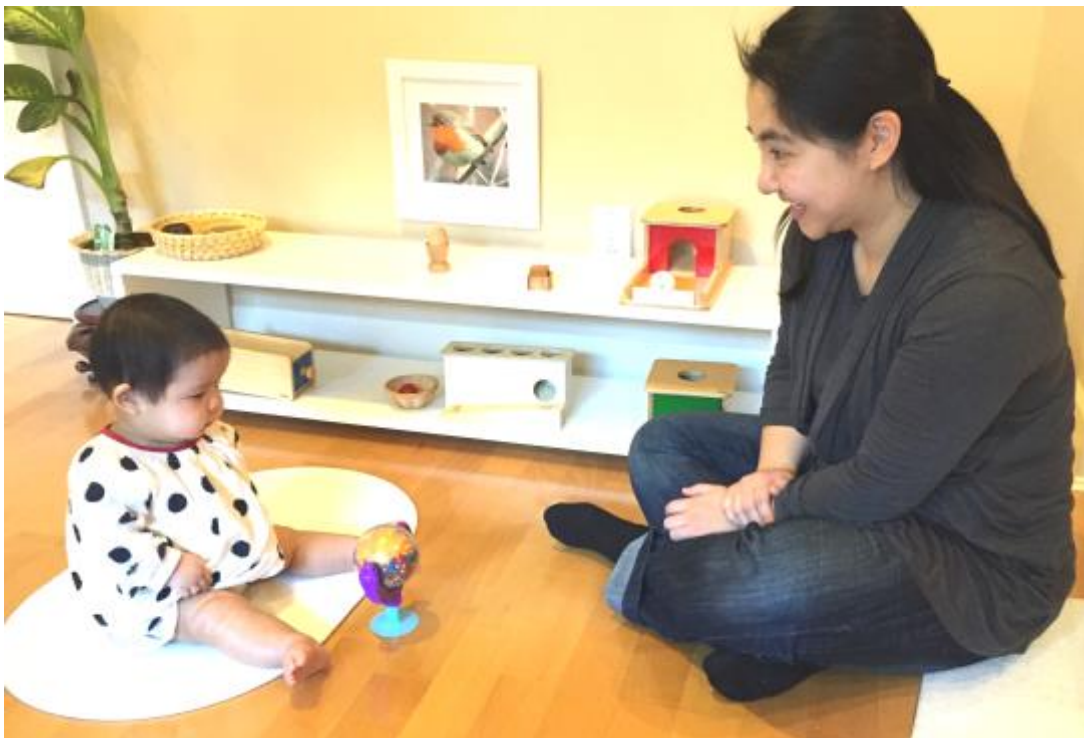
Mother and child attend a Parent-Infant Class

For children under the age of three, there are several Montessori environments. Created especially for working parents, a Nido is an environment prepared for children from 2 or 3 months until they are walking well. The Parent-Infant class provides a setting in which parents and their children, aged two to twelve months, are gathered under the care of a trained adult. After they begin to walk, the children join the Infant Community where their primary motor coordination, independence and language are cultivated. Rather than a classroom, it is a nurturing environment where very young children experience their first structured contact with other children.